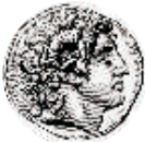
Municipality of Thessaloniki